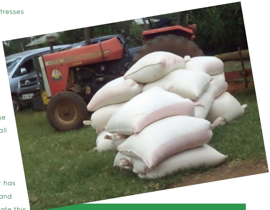
Bags of maize donated to the home