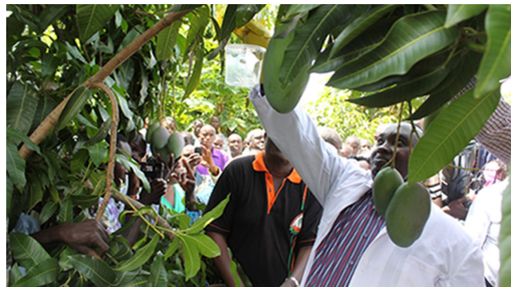
Elgeyo Marakwet Deputy Governor Hon. Gabriel Lamaon (right) officially launches the second mango fruit fly traps in the county