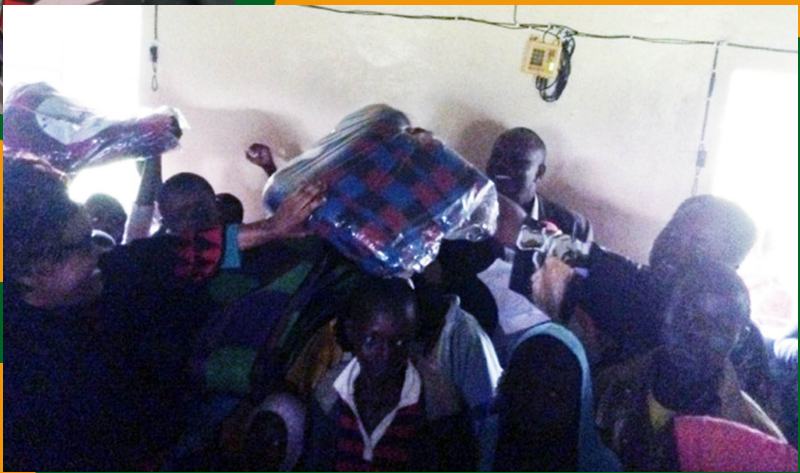
Blankets being given to the children