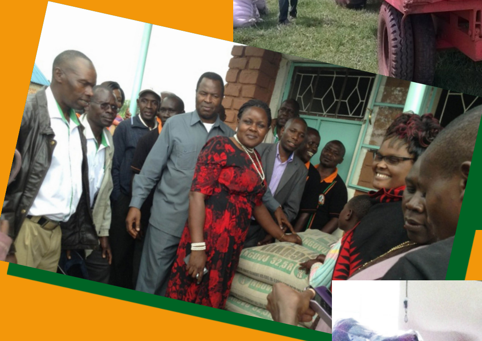
Cement donated to the home