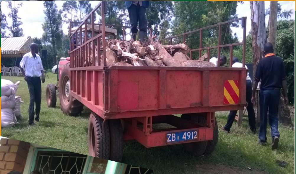
Firewood for cooking for the children