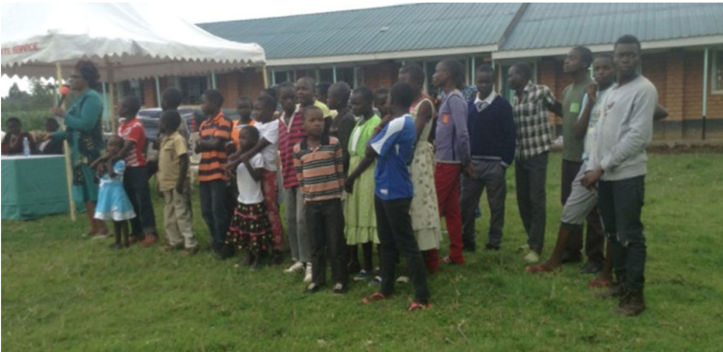
The children introduce themselves during the CSR activity

The home was the beneficiary of this year’s Corporate Social Responsibility activity.