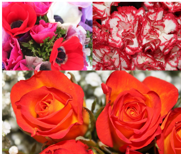
A variety of flowers exhibited at the IFTEX 2015