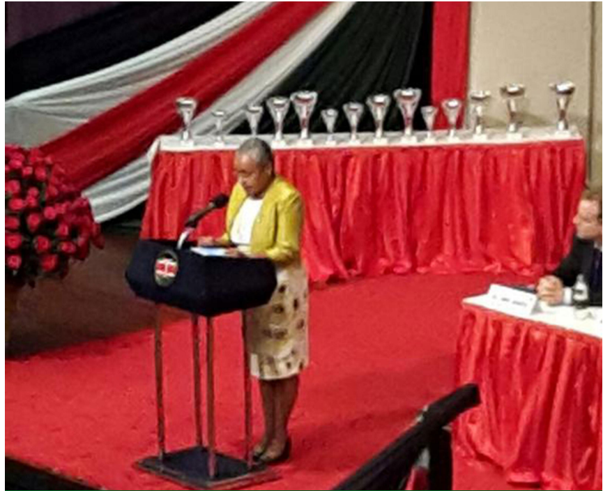
The First Lady, Her Excellency Margaret Kenyatta, reading her speech at the official opening of the IFTEX 2015

KEPHIS assures the quality of flowers for export, ensuring they are free of pests and diseases. The Corporation's Naivasha and Timau offices serve the flower growers in those regions. KN