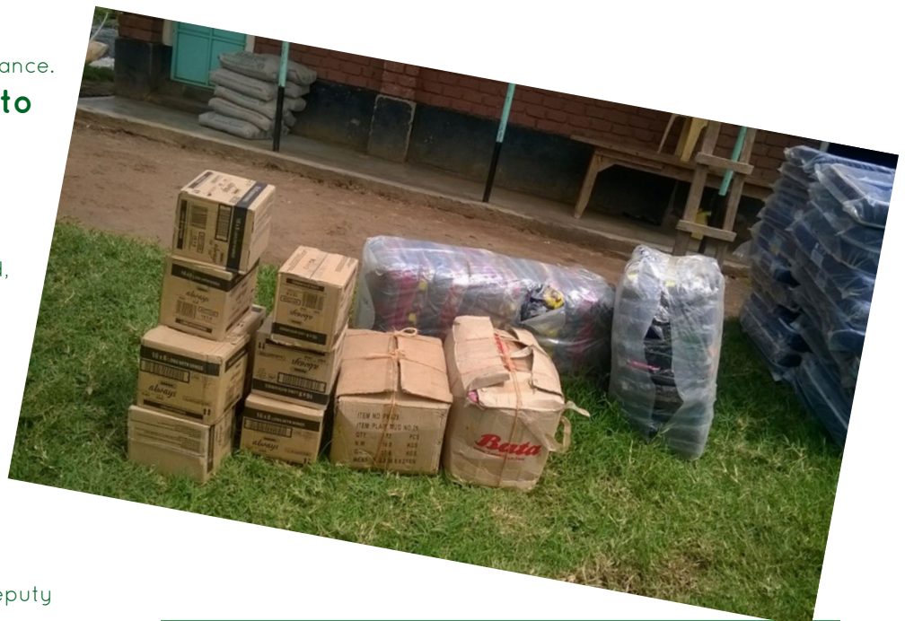
Sanitary towels, slippers, blankets and mattresses presented to the home