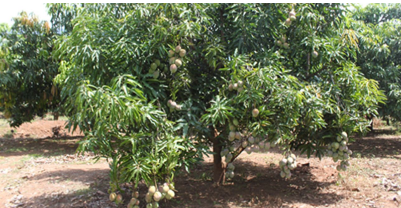
A mango tree in an orchard in Keiyo North, Elgeyo Marakwet County

by the Standards and Market Access Programme (SMAP). SMAP is a three year project that is building capacity of government agencies involved in standards setting, to enable export produce meet the stringent international export requirements. Currently, KEPHIS is working with mango growing counties to create pest free areas, thus facilitating exports, particularly to the key EU market. Elgeyo Marakwet is one of the Kenya's top mango producing areas with 518 hectares under mangoes. The county has an annual Cont. Page 2